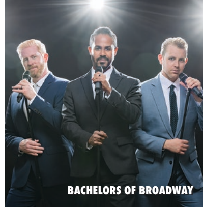
BACHELORS OF BROADWAY