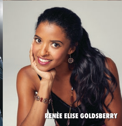
RENÉE ELISE GOLDSBERRY