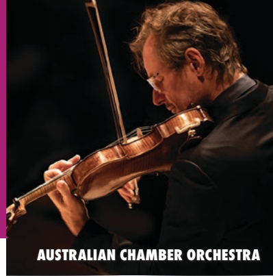
AUSTRALIAN CHAMBER ORCHESTRA

Join the Center's eClub to receive event updates, tickets, special announcements, ticket purchase opportunities, and more.