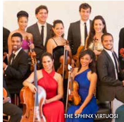
THE SPHINX VIRTUOSI